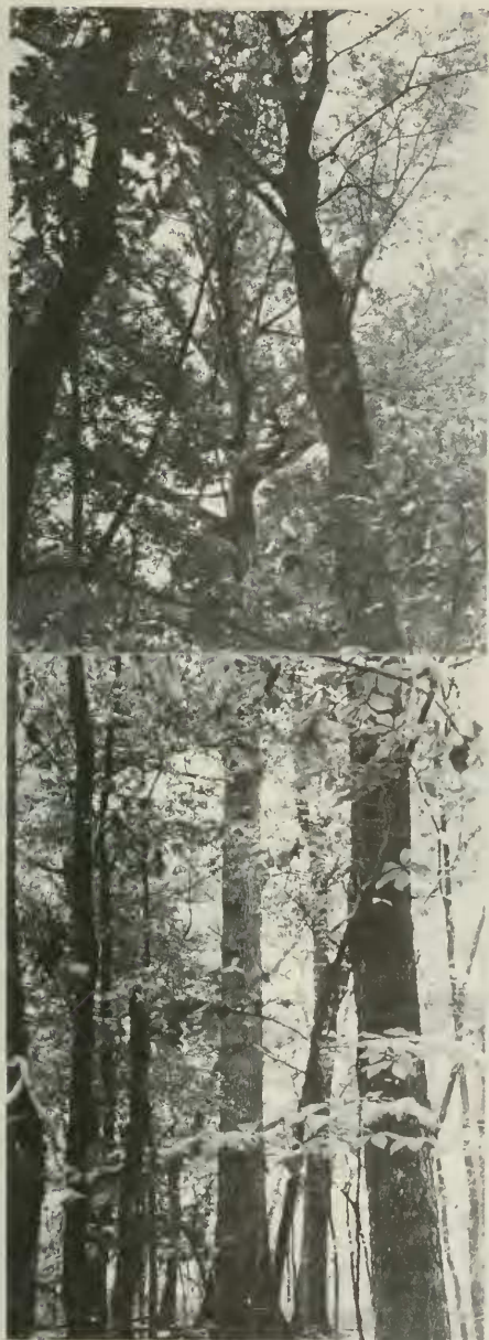
THE TYPE TREE OF QUERCUS SHUMARDII STENOCARPA Circumference 15 feet 11 inches Height 131 feet #1